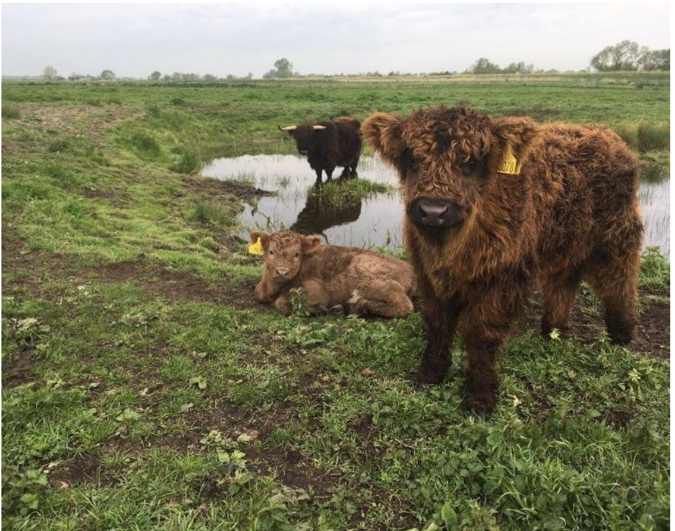
Max, Dovedale and Raven

We featured two of our newest konik pony foals last month, so it only seems fair to put the highland calves in the spotlight this time. The photo below shows Max in the foreground (born in March), with Dovedale (born late April) behind, and Mum Raven in the background. The naming theme for calves this year is National Trust properties, so Max is named after Max Gate in Dorset, and Dovedale after Dovedale Nature Reserve in the Peak District. The calves are all doing well and join the rest of the grazing animals in helping engineer the habitats for wildlife on the reserve. It's not only the grazing itself that is beneficial, it's the movement of the animals; spreading seeds that get caught in their hooves and coats; dusty hollows where they roll, and the well-trodden paths through grass that help create a diverse landscape.