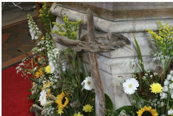
Left: Pulpit decorated by Soham Methodist Church

Five years ago St Andrew's Church held a flower festival with arrangements by our own flower arrangers and by other churches and community groups. Below are some of the pictures from that event.