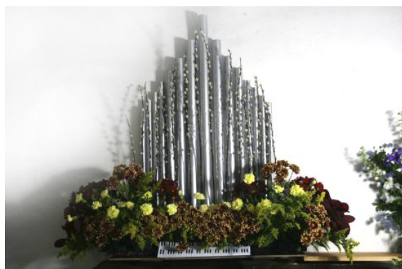
Above: Part of the church music corner.