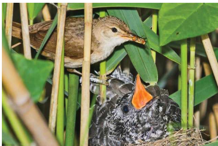
Reed warbler and cuckoo chick

a number of new foals and calves on the reserve, so there's plenty of new wildlife to spot while you're walking at Wicken Fen.