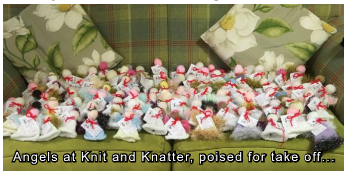
Angels at Knit and Knatter, poised for take off...

And was the holy Lamb of God, on England's pleasant pastures seen?'. Since I've been here in Soham, I've been struck by how often 'Jerusalem' is chosen as a hymn for weddings and funerals. One groom-to-be told me he'd picked it 'because of the cricket', but I think for many of us (and perhaps for him and his now wife, too) it's about more than that. 'Jerusalem' encapsulates an experience or an inkling we can't quite define. The Bible sums it up as 'God with us'.