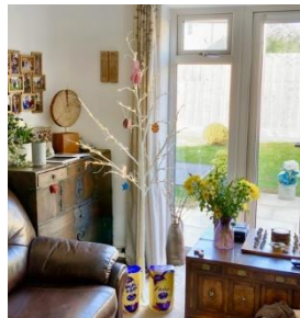
Easter Tree decorations