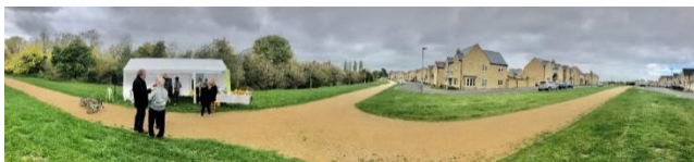
The photo above shows the marquee erected for our Harvest Food Bank event