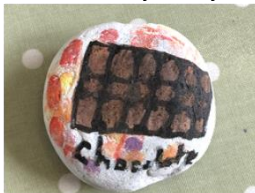
Stone decorating craft