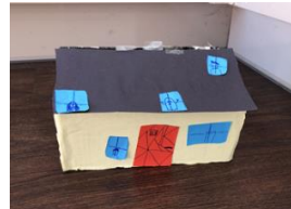
House building craft

In the summer of 2020 we held a Teddy Bears Picnic, with social distancing. This was well supported by the community and by town and district councillors.