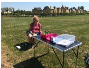
Distribution by Jacky