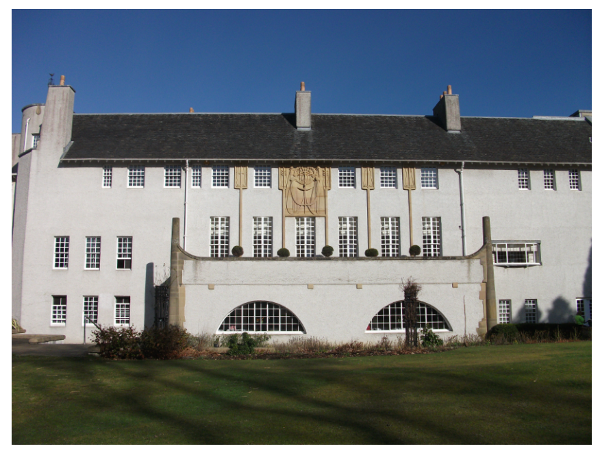
(The picture was taken in February 2016)

After my last, rather too difficult, question, I thought we'd better move nearer to home. This picture is of a relatively modern construction within the UK, but can you tell me it's name and where it's located (the city will suffice). Answer in the March issue.