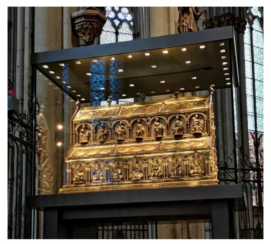
(This golden reliquary in Cologne Cathedral allegedly holds the last mortal remains of Melchor, Caspar and Balthazar)

What is recognised in the visit of the Magi is that it was not just for the Jews that Jesus came, but for all mankind. So however, God reaches you whether by personal touch, emotion, great praise or by deduction and logic as he did with the wise men. God is asking for recognition as to which of the two kings – King Herod and earthly power or King Jesus and eternal power - you are going to follow.