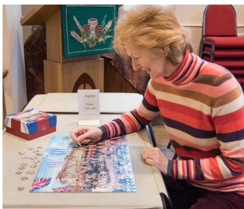
The Jigsaw Table