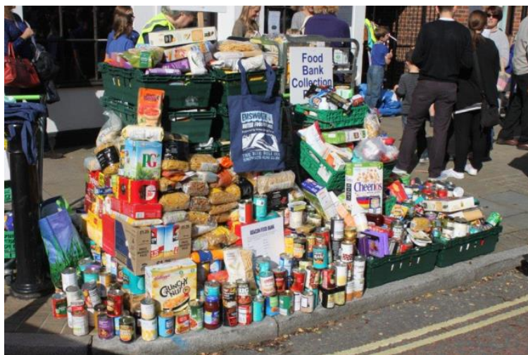
Christians Together Foodbank Collection