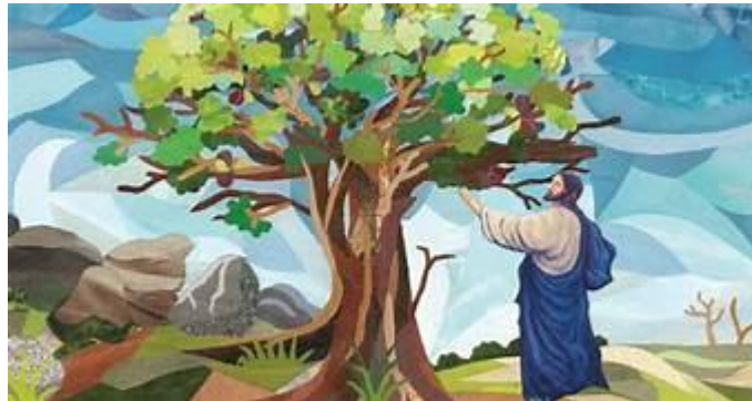
Fig trees are tall and broad and shady, making a good practical place to study, but it is also a tree redolent of fertility and growth – again showing us that by reading and studying scripture, we will learn more about God and that will nourish our lives. Things – and we – will grow if we feed ourselves. It is a real encouragement for us to commit to reading our Bibles. In Mark's Gospel, Jesus curses a fig tree that bears no fruit – a metaphor for those who reject him – so the fig tree then is a symbol to encourage us to commit to regular study of the Word.

On the next day, Jesus goes to Galilee with his new disciples (the lectionary misses out Nathanael's joke about 'Can anything good come from Galilee?') and it is here we encounter Philip and Nathanael who both, on encountering Jesus, recognise him and begin to follow him. Nathanael's name means 'God gives' in Hebrew but he is a figure who almost immediately understands exactly who Jesus is and what he has come to do – he represents the Jewish people who recognise Jesus as Messiah. The reference to the fig tree is an important symbol in telling us more about Nathanael: in the Old Testament, the fig tree is where people study the Torah.