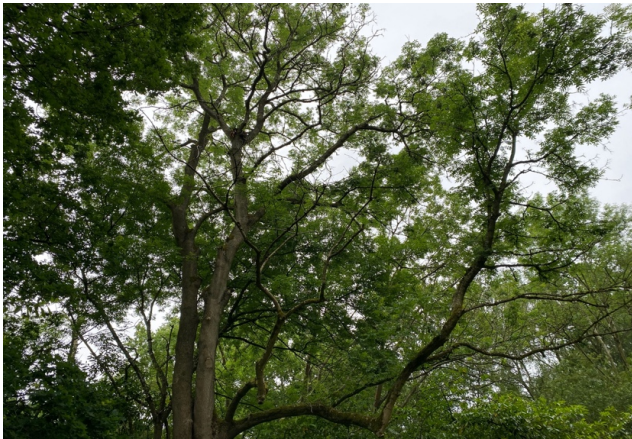
Photograph showing a large amount of dead wood and stunted foliage. This is an early sign of Ash die-back.

The issue can be seen in local woodlands and the problem is often left because there is currently no treatment for the disease, but the Forestry Commission is looking at plants' resistant to the disease.