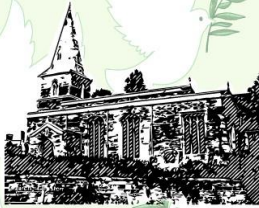
All Saints, Clipston