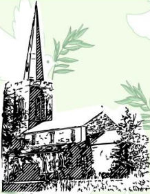
All Saints, Naseby