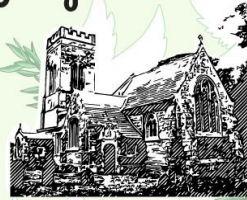
St Michael's Haselbech