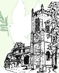
St Nicholas' Marston Trussell