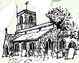
St Helen's Sibbertoft