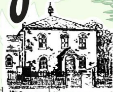
Welford Congregational Chapel

... Because no one can be at peace unless he has his freedom. Malcolm X