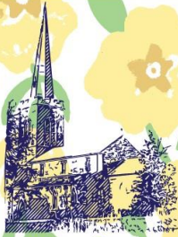
All Saints, Naseby