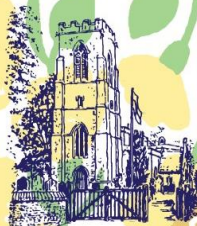
St Mary The Virgin, Welford