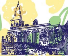
All Saints, Clipston