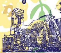
St Michael's Haselbeck