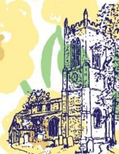
St Nicholas' Marston Trussell