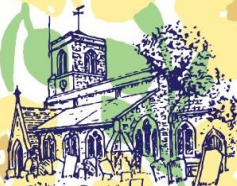
St Helen's Sibbertoft