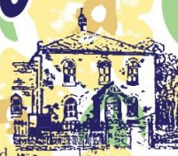
Welford Congregational Chapel