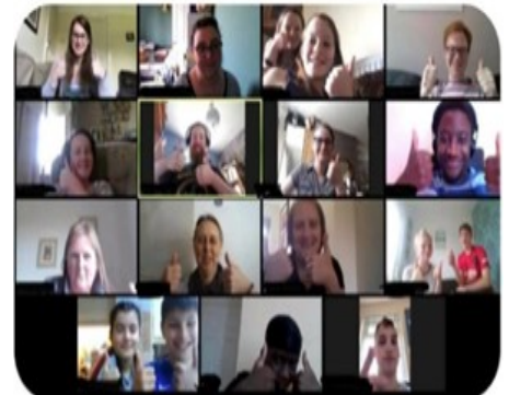
Photo of the group all with permission

The weekend was fun we did many fun activities, and games, like a few escape rooms, bingo, a quiz, and many more. I got to see some friends that I haven't seen in so long. The weekend was busy but lots of fun.