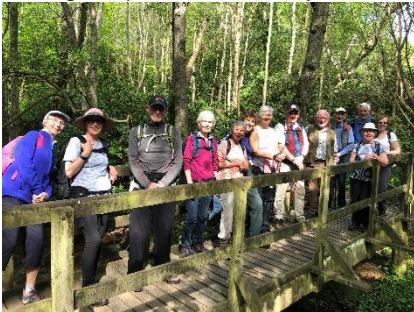
Walking Group near Gifford in May