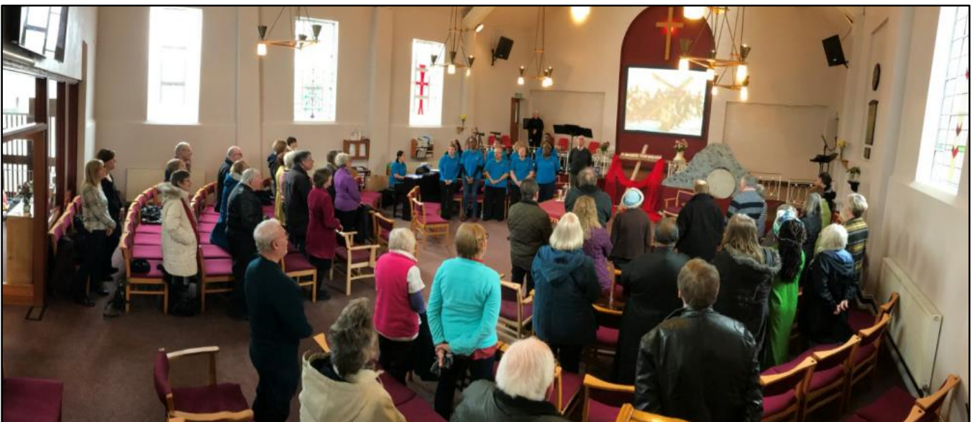
Good Friday Service held at Aylestone Baptist Church

Aylestone Baptist Church where we had a service telling the story of the crucifixion and we listened to the ABC choir, afterwards we shared fellowship together over hot drinks and hot cross buns.