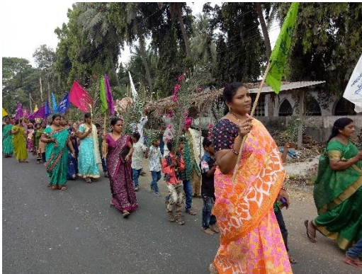
On Palm Sunday they did a parade of witness in Akividu

He writes :- 'My humble requests - Please pray for all these programmes; this year many extra funds needed for increasing calls on our ministry, please help if you can'