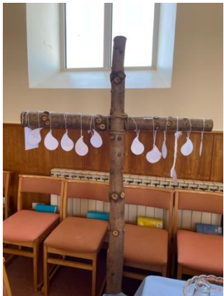
Bottle of Tears with the prayers written on tear shapes