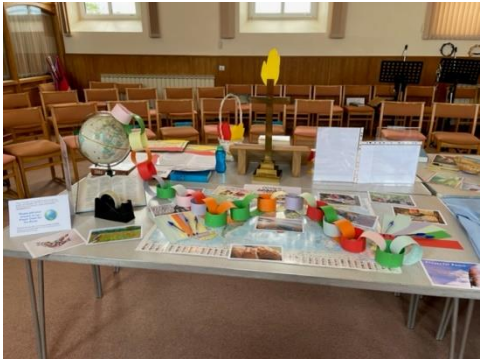
Prayer chain for the world