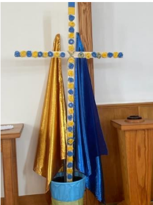
Prayer cross for Ukraine