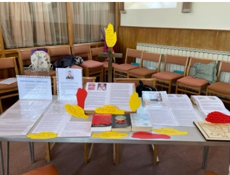
Inspirational Christians (including the Queen)

On Saturday 21 May Bethlehem held a 12 hour prayer day with a variety of prayer stations. We followed the day with a reflective healing service on the Sunday.