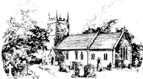
All Saints, Somerford Keynes