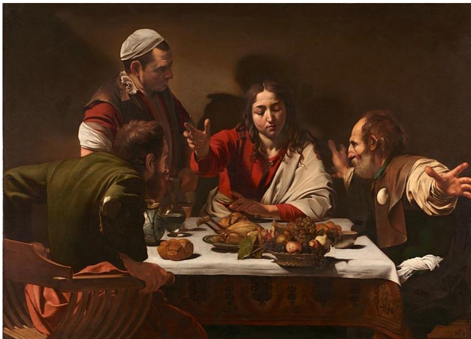
The Supper at Emmaus [1601]. Caravaggio [1571-1610]

This evening's readings take us beyond this morning's excitement at the discovery of the empty tomb. The Old Testament lesson concerns another dimension of resurrection.