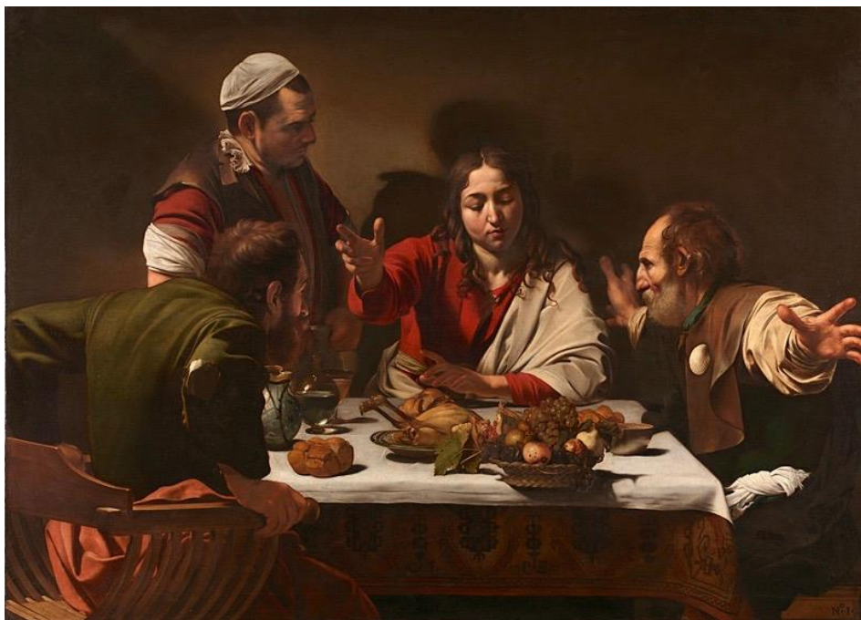
The Supper at Emmaus [1601]. Caravaggio [1571-1610]

This evening's readings take us beyond this morning's excitement at the discovery of the empty tomb. The Old Testament lesson concerns another dimension of resurrection.