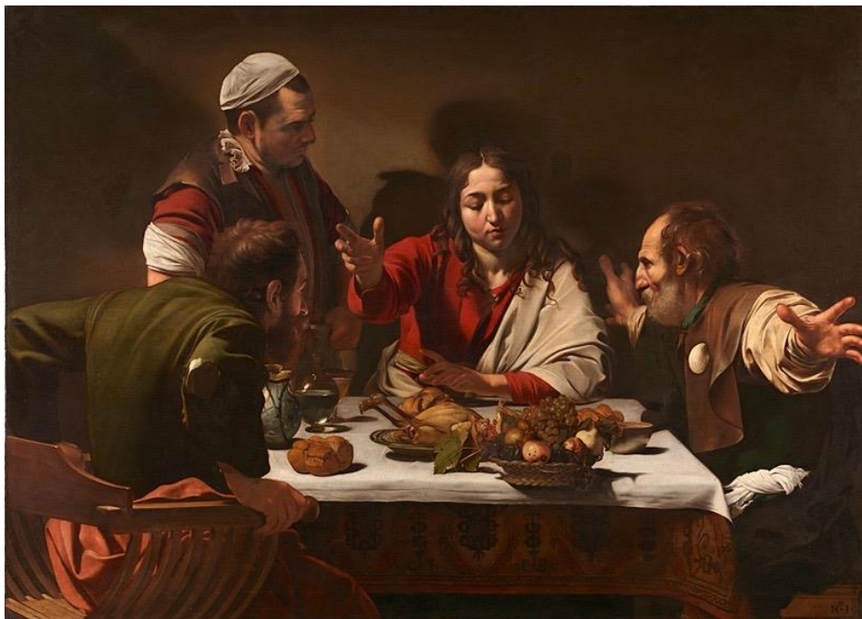
The Supper at Emmaus [1601]. Caravaggio [1571-1610]

This evening's readings take us beyond this morning's excitement at the discovery of the empty tomb. The Old Testament lesson concerns another dimension of resurrection.