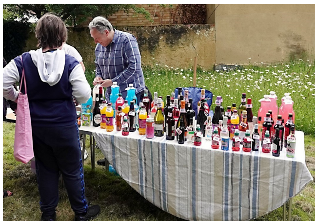
Left: the bottle and sweets Tombola stalls always do a good trade!