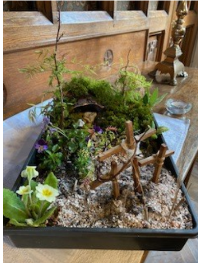
Easter Garden at Wanlip Church

(If longer, the editor reserves the right to edit.)