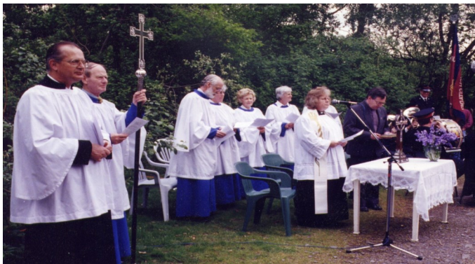
A photograph from the 1990s

I have very special memories of an annual event in Swithland, my last parish. It has been held very nearly every year since 1928. And I can't resist sharing it with you.