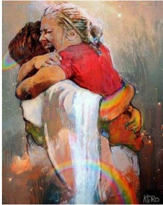
'First Day in Heaven' (Kerolos Safwat)

'KEEP IN TOUCH', Summer 2023 Copy by, but, if possible, before 1 st May 2023