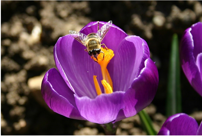
Hover Fly on Crocus