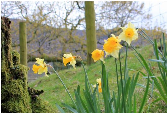
Daffodils in the Breeze

'KEEP IN TOUCH', Summer 2023 Copy by, but, if possible, before 1 st May 2023