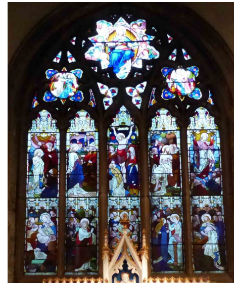
Belgrave St Peter's Church

I believe, however, that is not all that the Lord wants. On Christmas Eve, St Peter's Belgrave became a blaze of bright white light. I believe that I am very clearly being told by the Lord to get things ready to put his message into Belgrave Church even though it is shut. The Lord is writing the story. I am having great fun sorting things out!