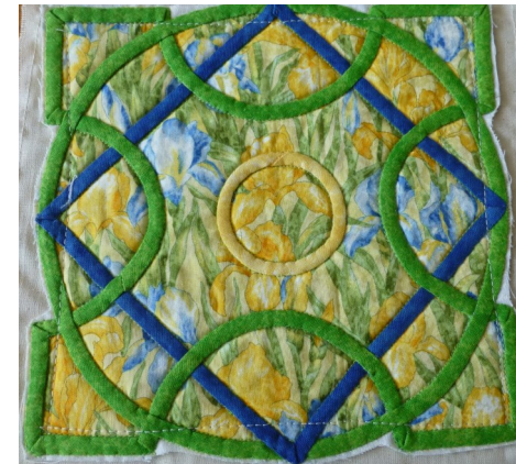
Ordinary Time Banner Tile St James' Church, Birstall