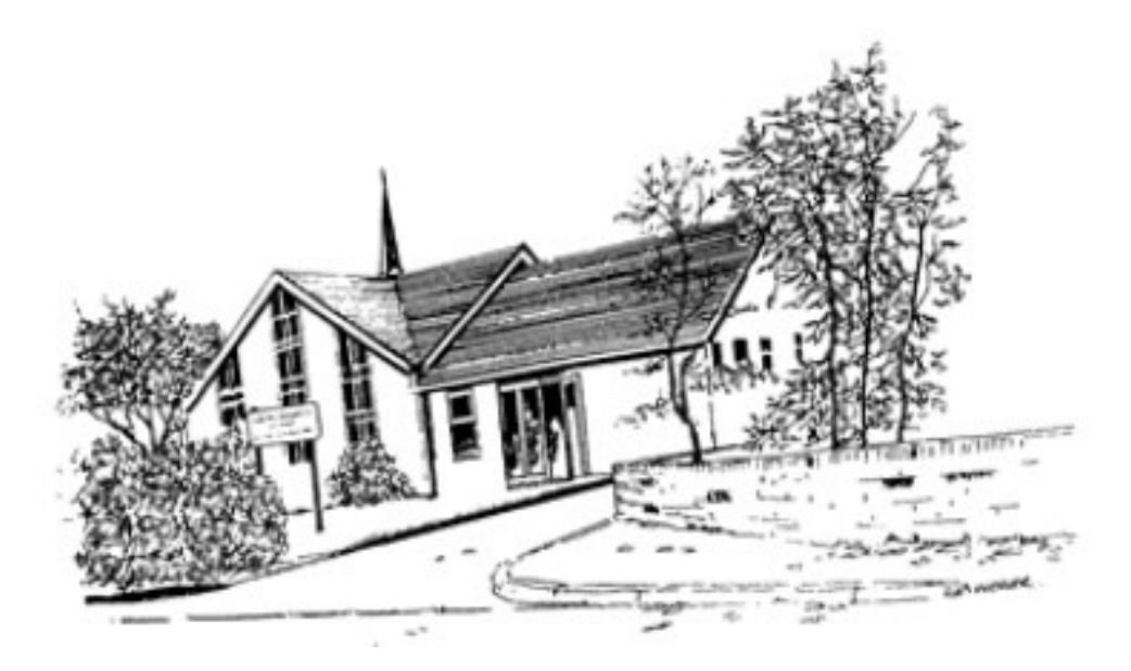
Dunwich Dr, Toothill, Swindon SN5 8SX

Toothill Church Website: www.toothillchurch.org.uk