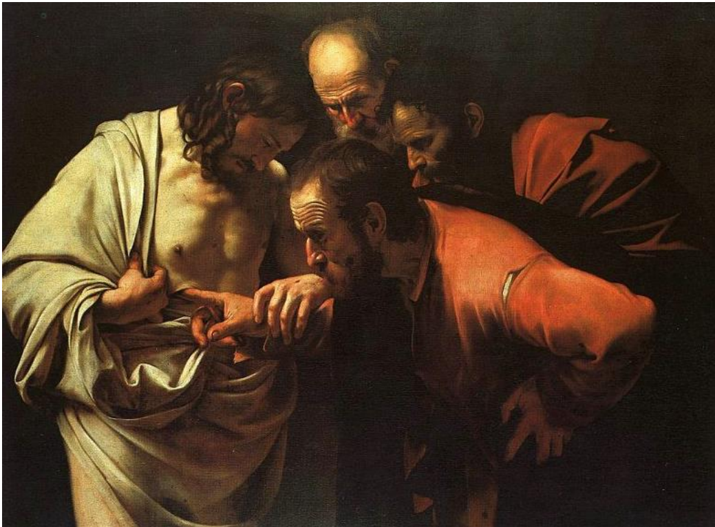
Caravaggio - The Incredulity of Saint Thomas

Spend some to time, if you can, in quiet contemplation, asking the Holy Spirit to show you what the scriptures have to say to you today. And then spend time praying for the Church, the world, and all who suffer.