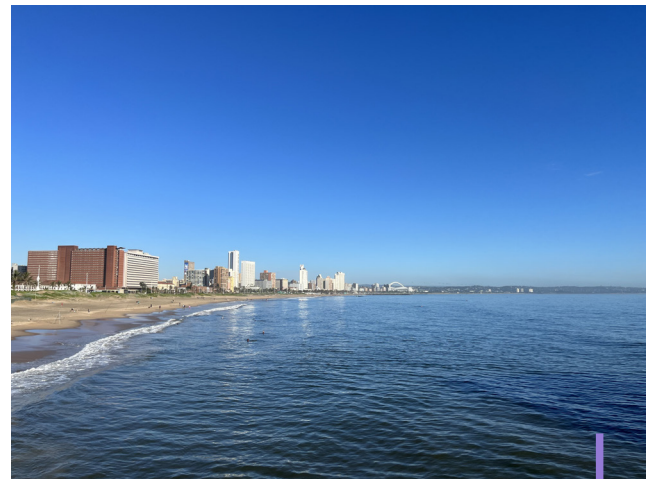
A magnificent early morning in Durban.

I then spent five days at CMS's Africa People in Mission Conference in Kenya before moving on to Juba, capital of South Sudan, to visit ACROSS, a South Sudanese Christian organisation with a history of partnership