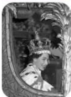
The Press Association