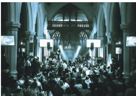
502 young people attending the Higher Cambs gig at St Mary's Eaton Socon, October 2018

In 2018, Higher Cambs saw over 13,000 young people hear about Christianity in their secondary schools. In that year, nearly 2,000 young people attended an evangelistic music event and 784 took home a response pack, including a Bible. This would not have been possible without the support of local churches and communities. Higher Cambs is returning in October 2020 and we would love for you to get involved! Search for 'Higher Cambs' on the diocesan website to find out more.