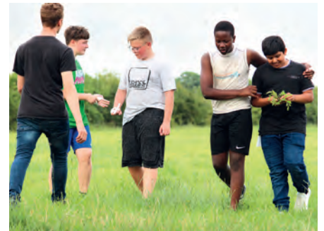
Young people attending Thrive Huntingdon Residential, July 2019

Thrive Youth Work ('Thrive') is a Christian youth project, currently working in Huntingdon and Wisbech, supported by the Diocese. Thrive works with churches, schools and communities to provide programmes that offer emotional, social and spiritual growth for young people. This work includes mental health mentoring, motorcycle riding, youth cafes and new Fresh Expressions launched for young people and their families.