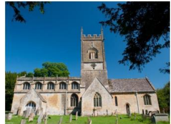
St Michael All Angels Withington The Church of England's first net zero carbon church in the modern era