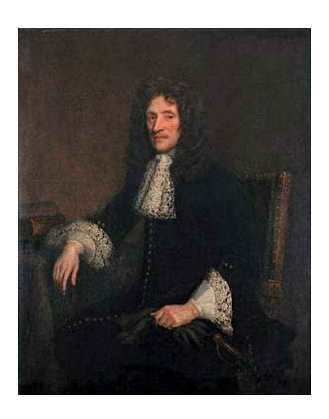
Tobias Rustat (bap. 1608, d. 1694) by Sir Godfrey Kneller, 1682 Jesus College, Cambridge; photograph © National Portrait Gallery, London