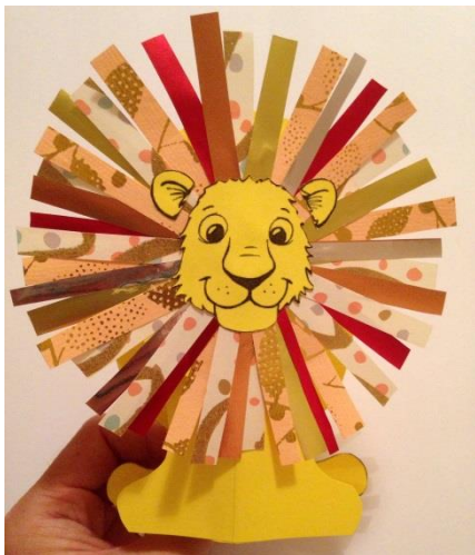
7. Glue head to top of front legs