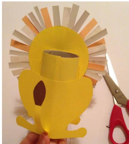
8. Trim the mane to size if needed