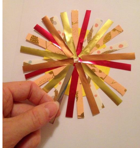
5. Cover yellow circle with glue. Stick on paper strips until circle is covered