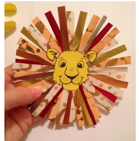
6. Stick on face and ears.