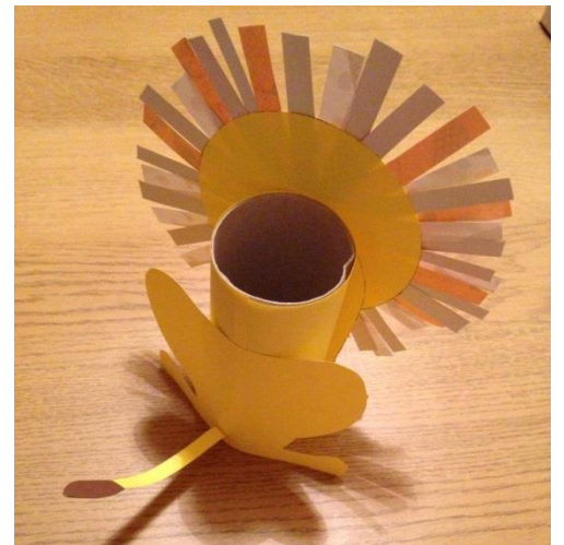
9. Add brown tip to the tail