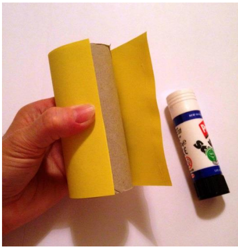
1. Wrap tube in yellow paper