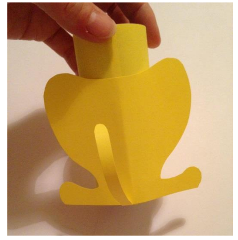
3. Glue back legs to reverse of tube.