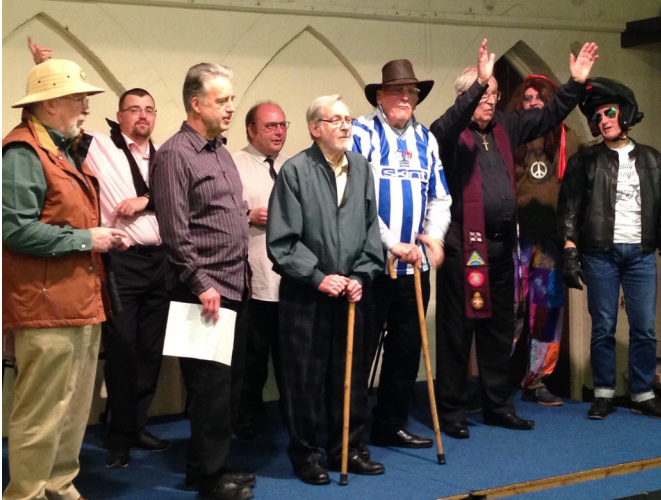
Men's Fellowship Misfits