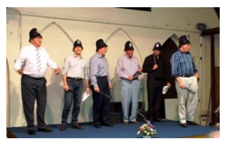
A POLICEMAN'S LOT!