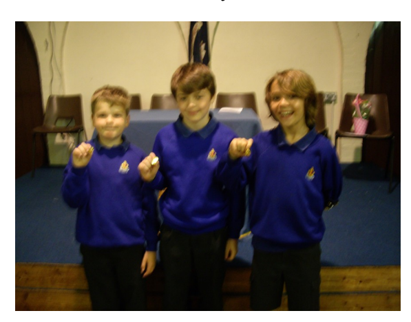
The Golden Boys