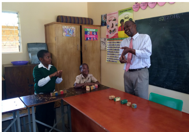
Learning can be fun at Batsari Special School

No further action required for photocopying