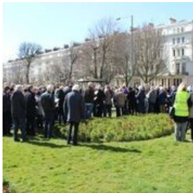
Praying at Palmeira Square