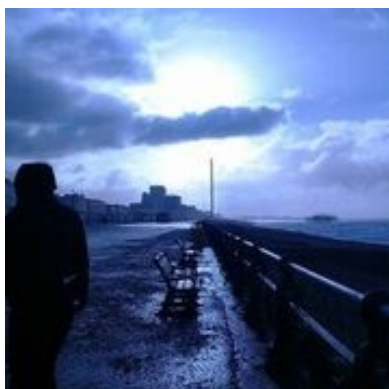
Seafront Easter Sunday Morning