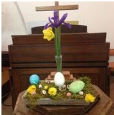
New Life Cross