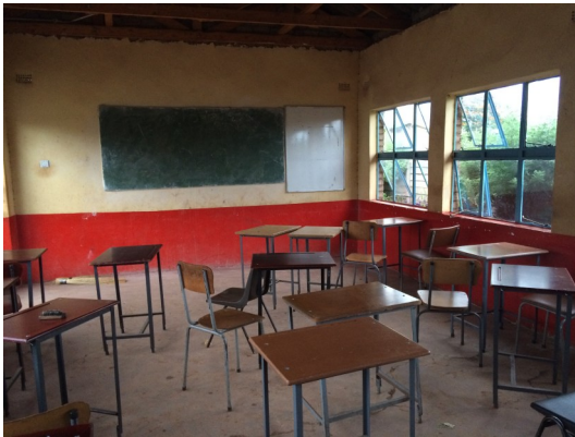
A classroom—very minimal by our standards