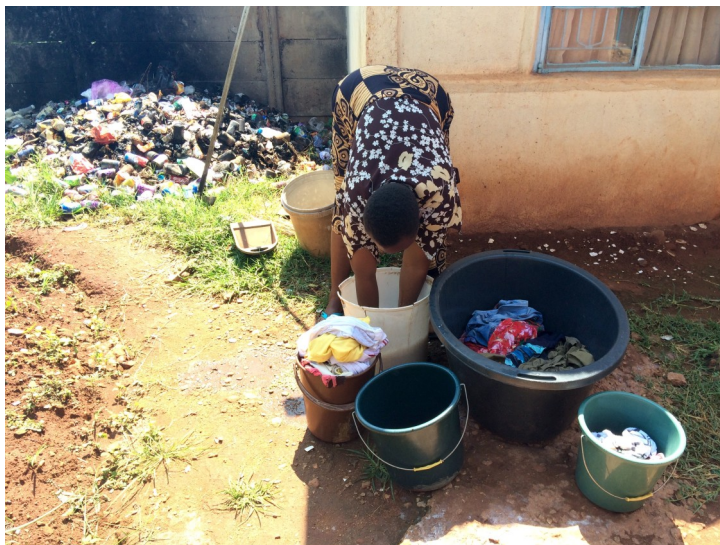
The weekly laundry takes Four hours by hand.