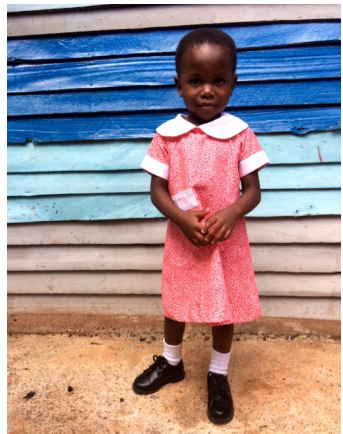
Her first day at Pre-school