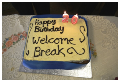
Of course there was a cake!