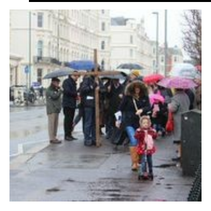
Starting off from St Johns