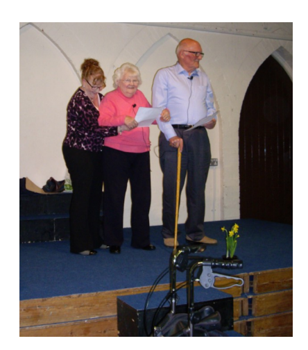
I'd do anything for you, dear.