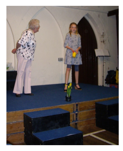
Hole - Bucket