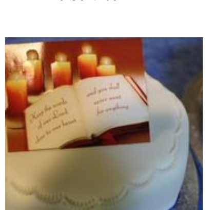
The Word of God Keep the words of our Lord Close to your heart.. And you shall never want For anything.