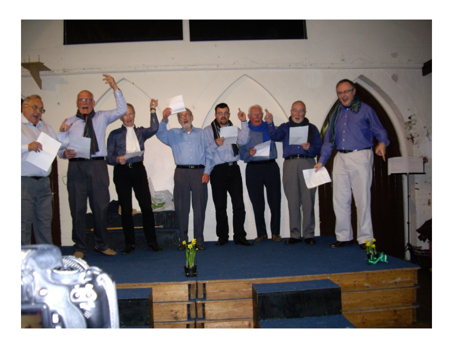
Those "magnificent men" in their Flying Machines!