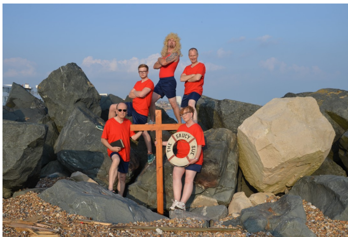
The J Team