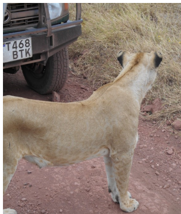
Not a zebra crossing!