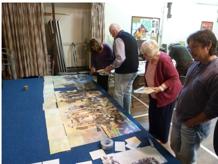
Assembling the individual parts