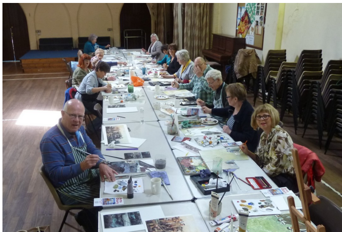
Painting the square