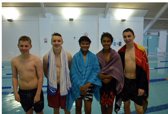
The Tenth Swimming Team