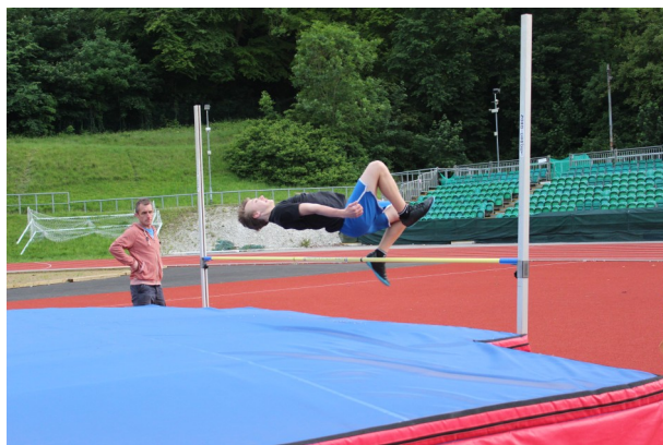
BB Athletics Evening