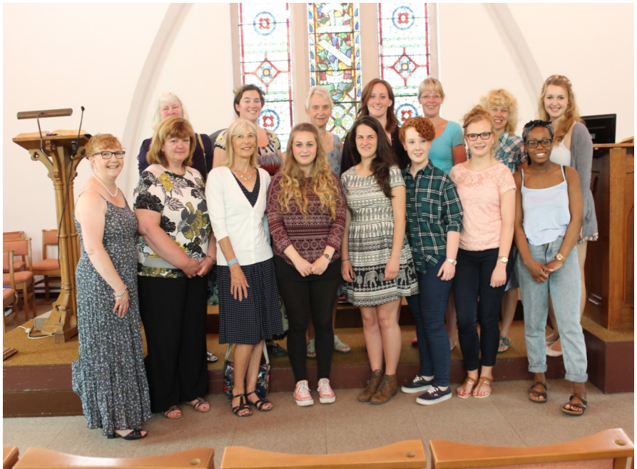
Some of the Duke of Edinburgh Award winners at the Service 22nd June.