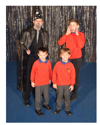
The Anchors are back