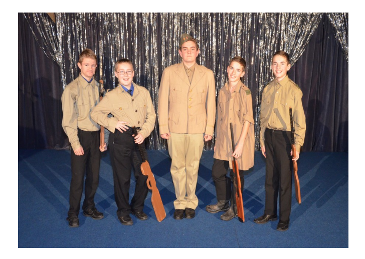
DRILL—as never seen in the BB