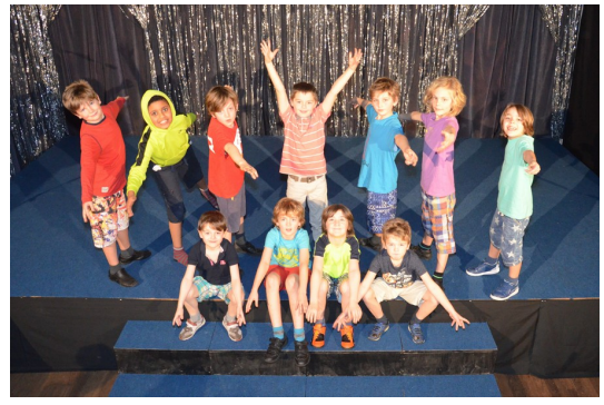
The "Super...." Juniors