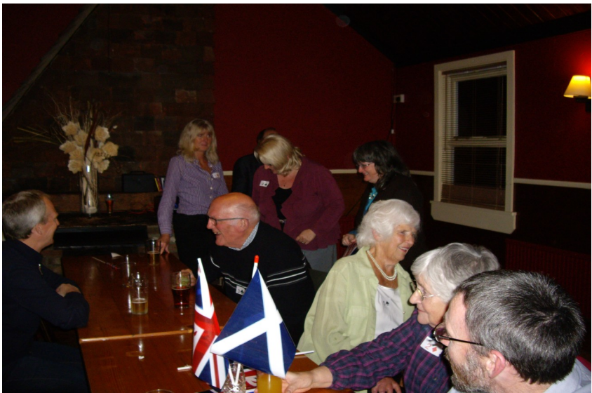
Men's Fellowship - Skittles Evening