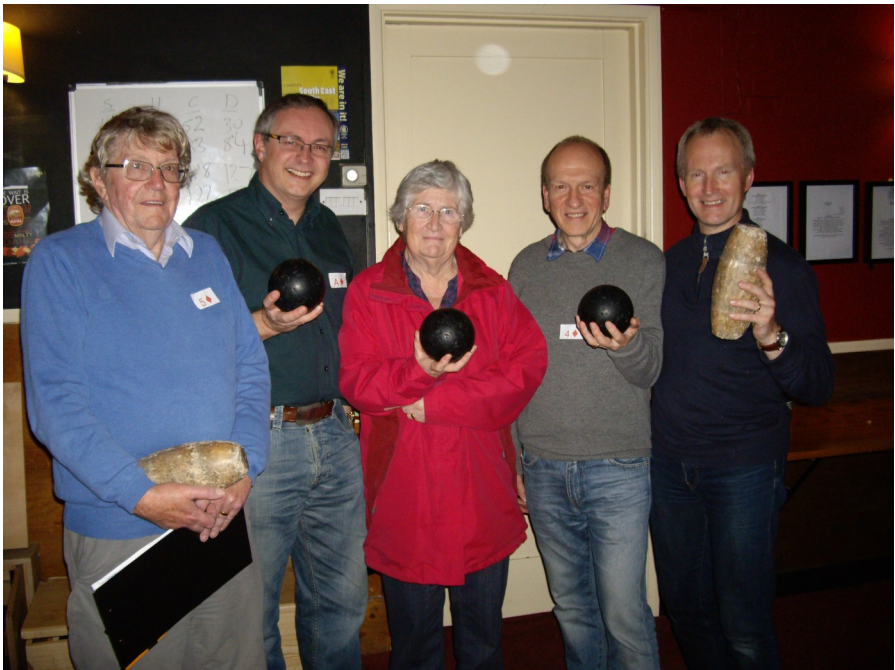
Diamonds - The winning team.