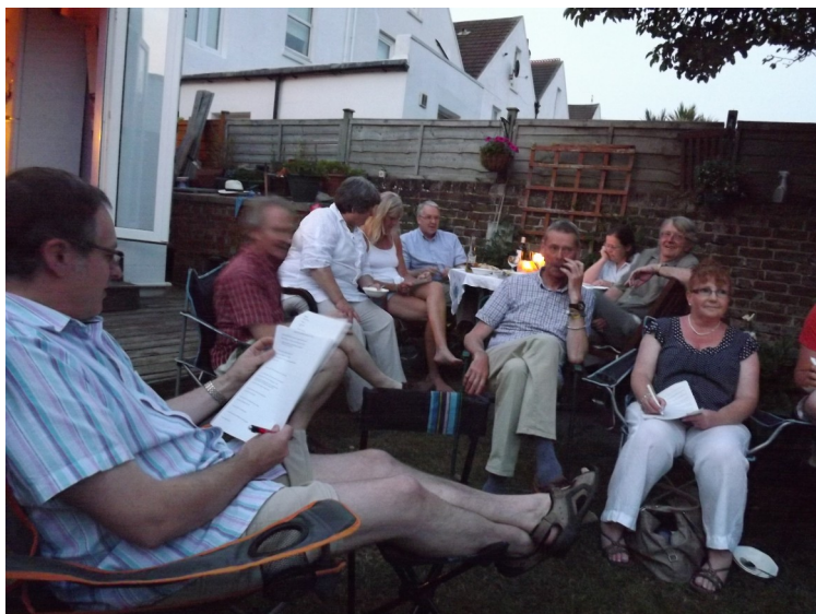
THE JUDGE'S ANSWER IS FINAL!