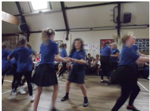
GB Awards Evening