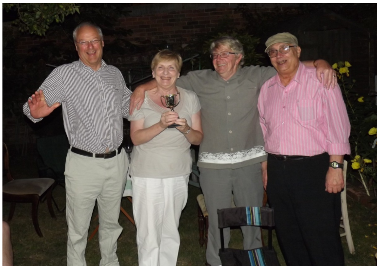
THE WINNERS - 2013.