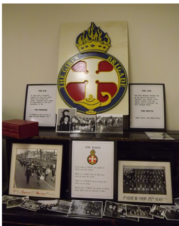
GB & BB Memorabilia.