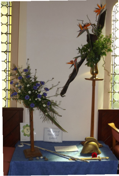
David & Goliath