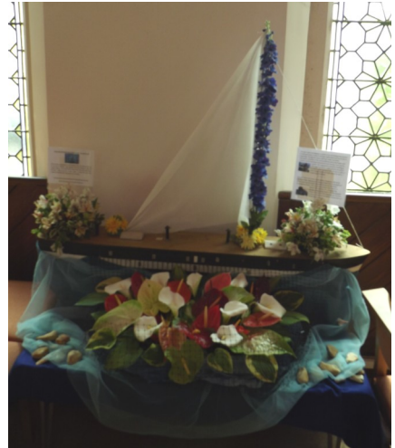
Jesus calls the Disciples