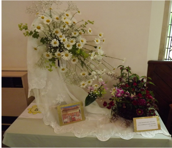
The Wedding at Canaan - Jesus turns water into wine