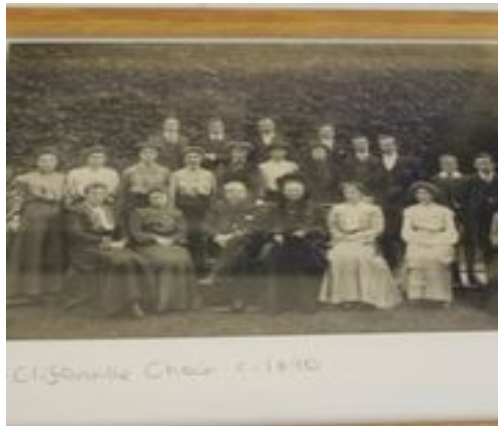
Sunday School Teachers' Outing