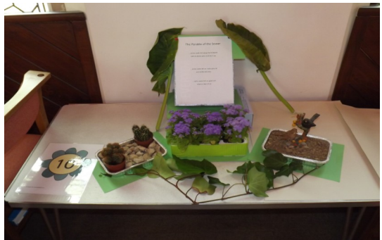
The Parable of the Sower