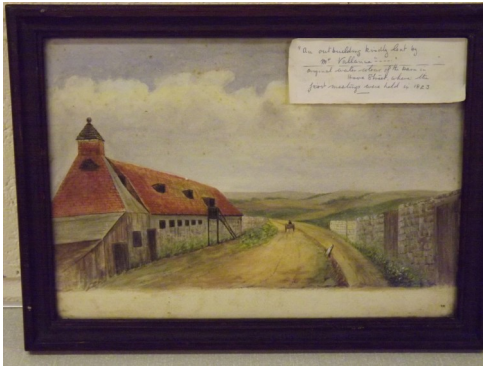
The Barn where the original Sunday School was held.