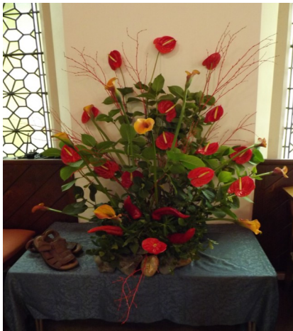
Moses and The Burning Bush