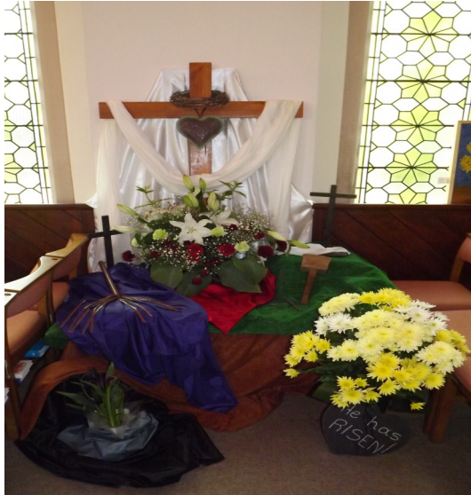
The Easter Story