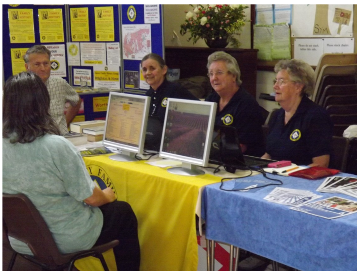
SUSSEX FAMILY HISTORY STALL

So many gifts, so much good will and friendship were evident in the amount of work done, time given, helping hands extended over the week by the people of the church from 4 - 90 + years of age that it would be invidious to name names, so I won't. When everyone works together for a common cause wonderful things can happen. Our truly deep thanks to everyone in Central or associated with it; to our friends from neighbouring churches who supported us by giving of their talents and time or by visiting; to our friends who returned and showed they had not forgotten us; to neighbouring businesses who gave their support in various ways, and to God be the Glory for He truly blessed us.