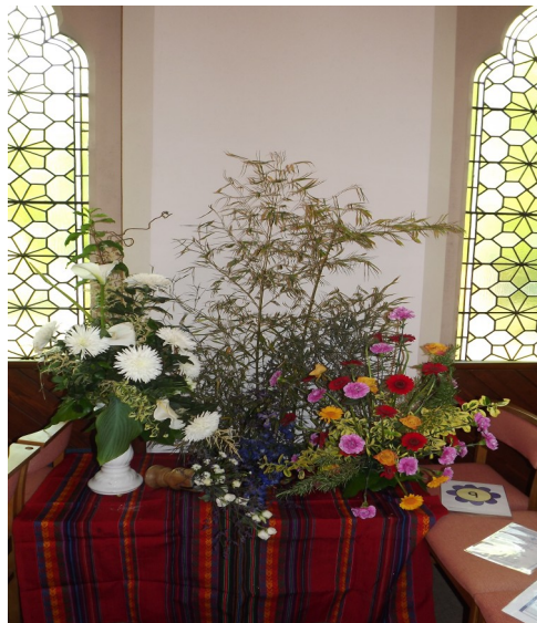
Jesus and the Samaritan Woman