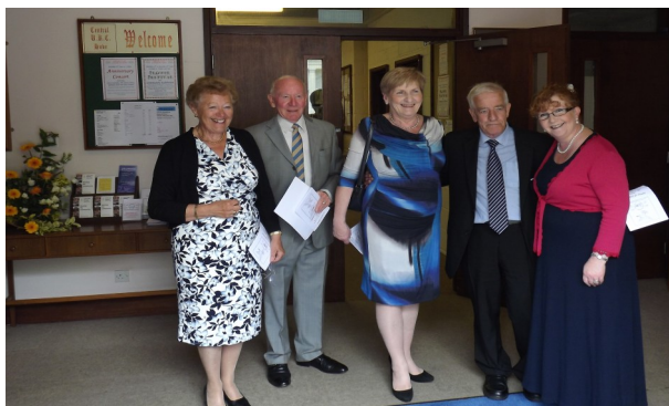
The Welcome Pack Or Meet & Greet Squad