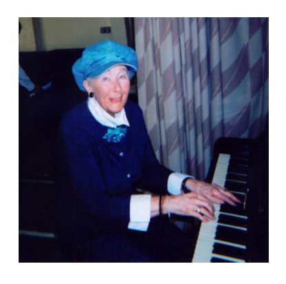
Priscilla the Pianist