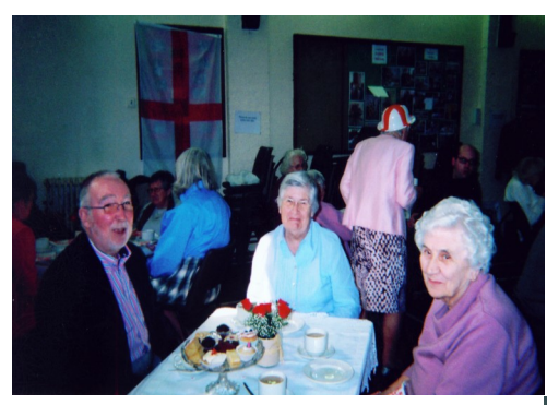
The Celtic Fringe