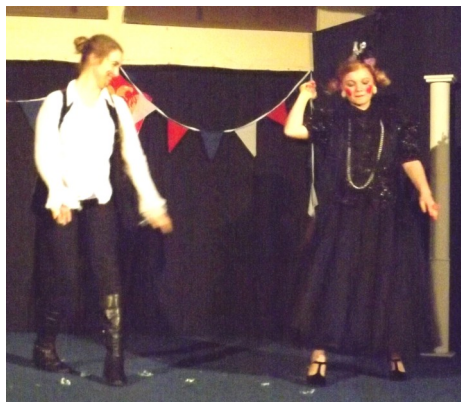
DICK WHITTINGTON GB PANTOMIME 2013