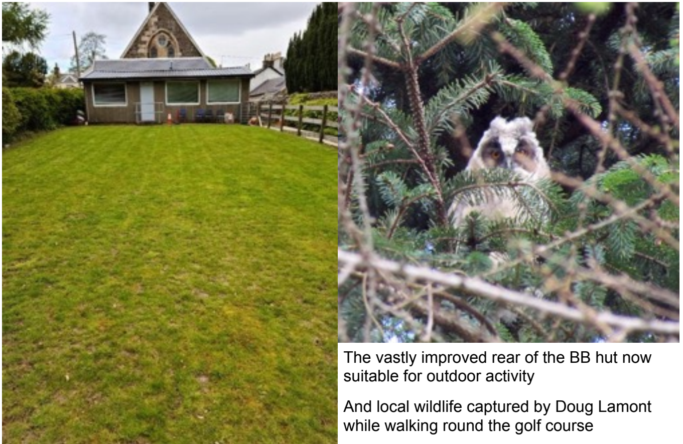
The vastly improved rear of the BB hut now suitable for outdoor activity