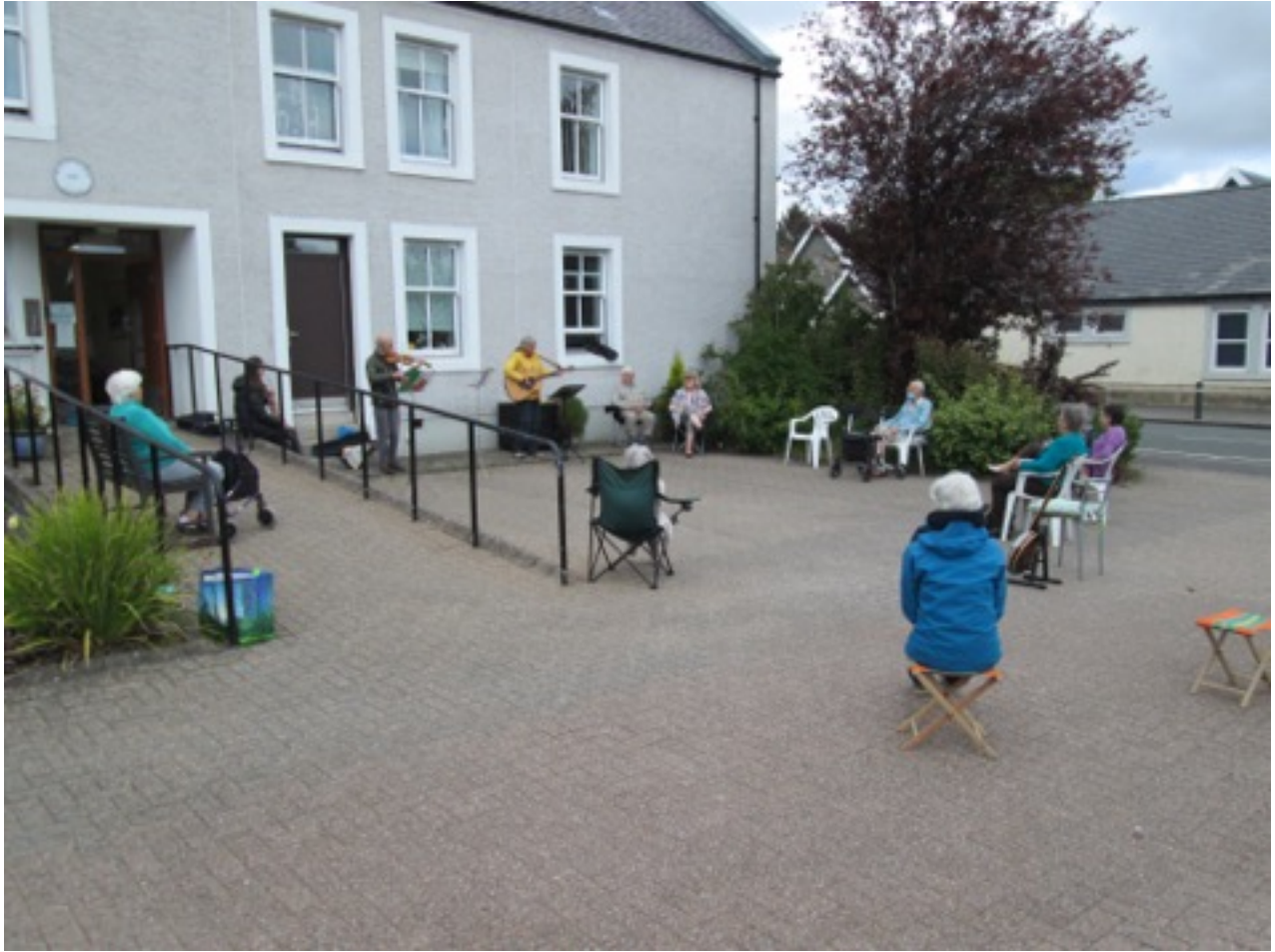
Socially distanced entertainment at Montgomerie Court during the lockdown. A Thursday afternoon music and singing session - weather permitting.