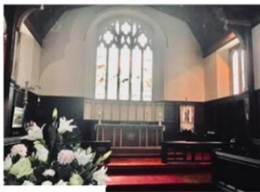
St. Simon's, Simonside

Welcome to the Parish of Jarrow and Simonside