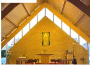
St John's Jarrow

Jarrow and the surrounding area has long held a fascination for Pilgrims, as an ancient centre for Christian worship, learning and scriptorium since the Seventh Century. St. Paul's Church is a place where our Anglo-Saxon heritage and history becomes tangible as thousands of people visit the church and site of the Former St. Paul's Monastery, made famous by our local Saints: Benedict Biscop and The Venerable Bede.