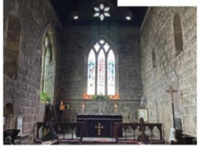
St Paul's Jarrow

Welcome to the Parish of Jarrow and Simonside