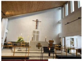
St. Peter's, Jarrow